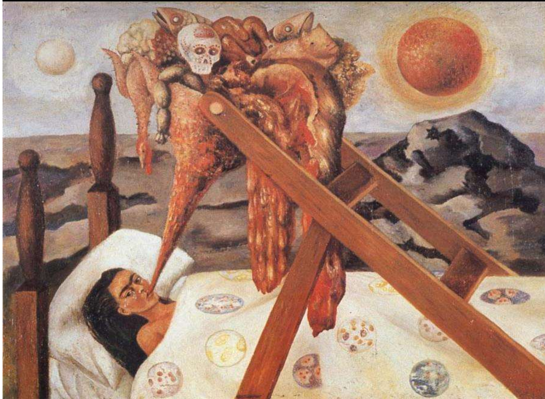
Without Hope, 1945