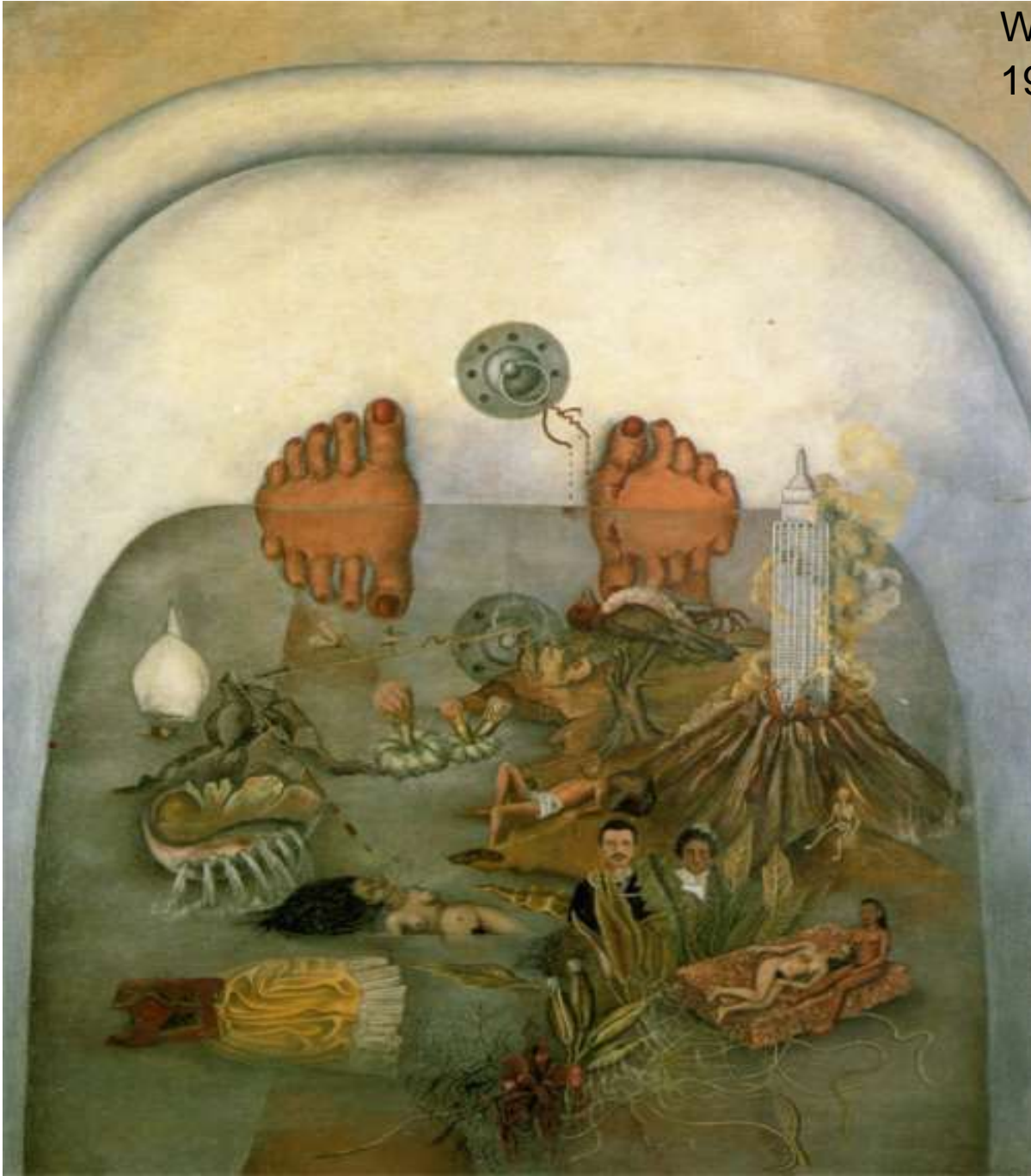
What I Saw in the Water or What the Water Gave Me," 1938

In this unusual Self-Portrait, Khalo shows, in a typically expressive and descriptive way, the many fantastical* influences on her life: