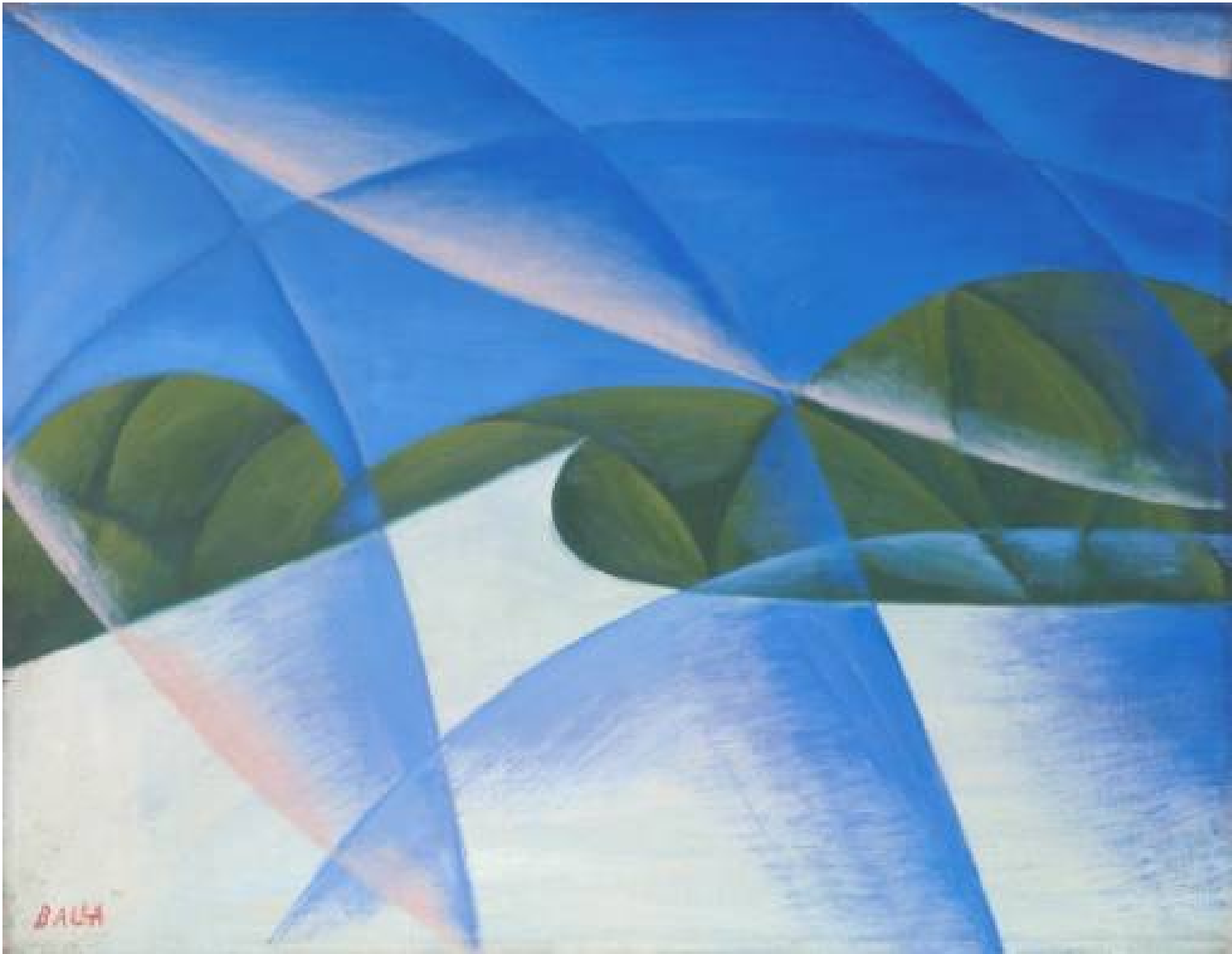
Giacomo Balla, Abstract Speed The Car has Passed, 1913