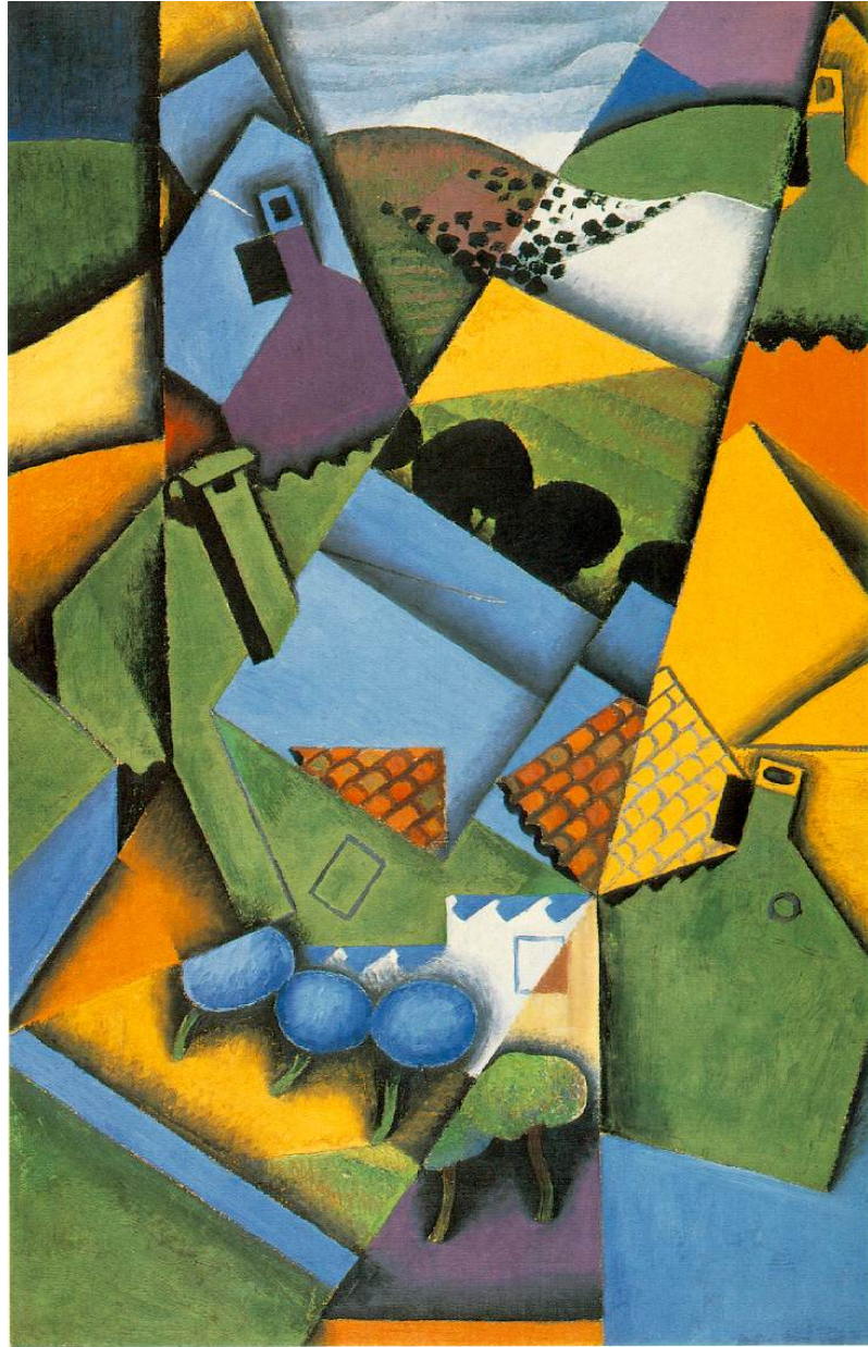
Juan Gris Ceret 1913