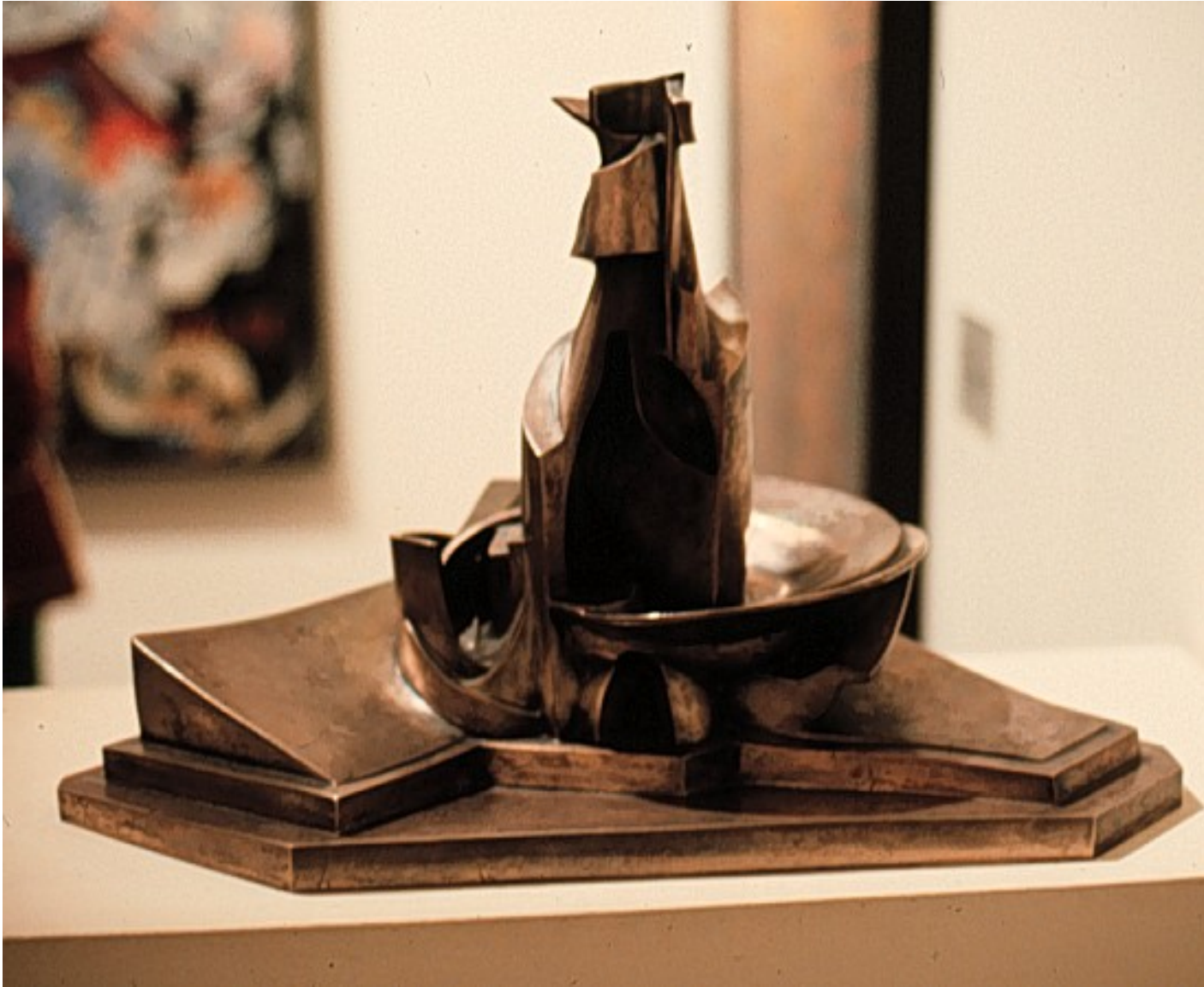
Umberto Boccioni Unique Forms of Continuity in Space, 1913