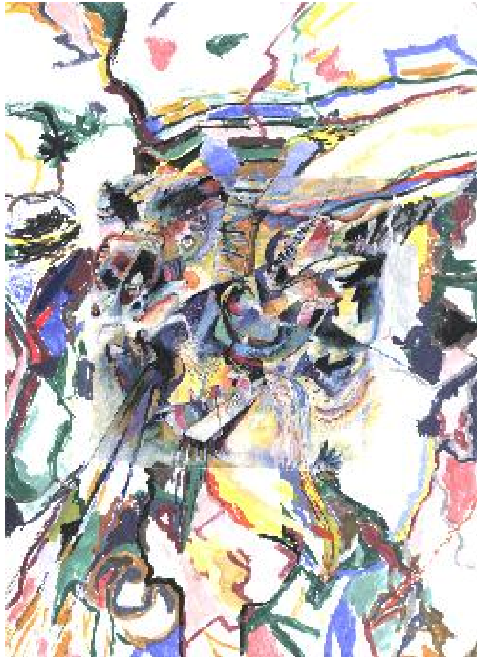
Wassily Kandinsky Improvisation Klamm 1914