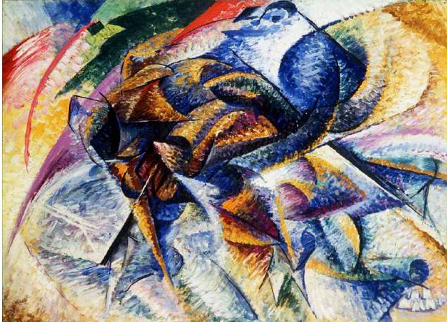
Umberto Boccioni Dynamism of a Cyclist, 1913