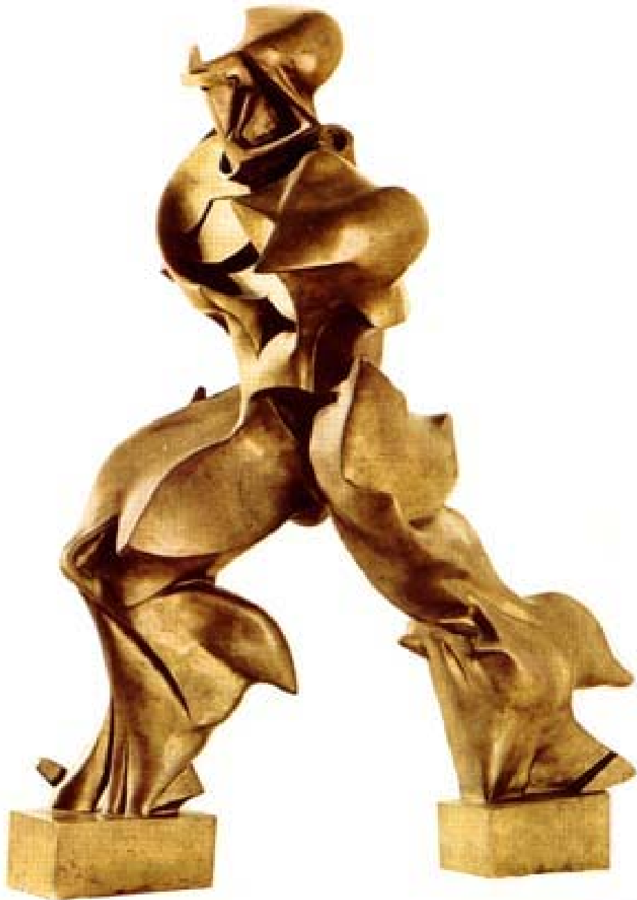
Umberto Boccioni Speeding Muscles 1913