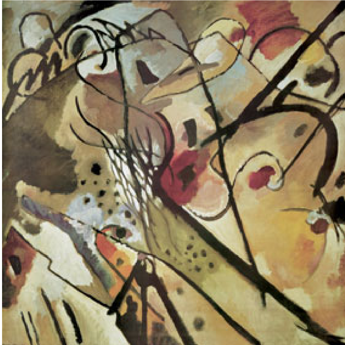
Wassily Kandinsky Improvisation No. 30 1913