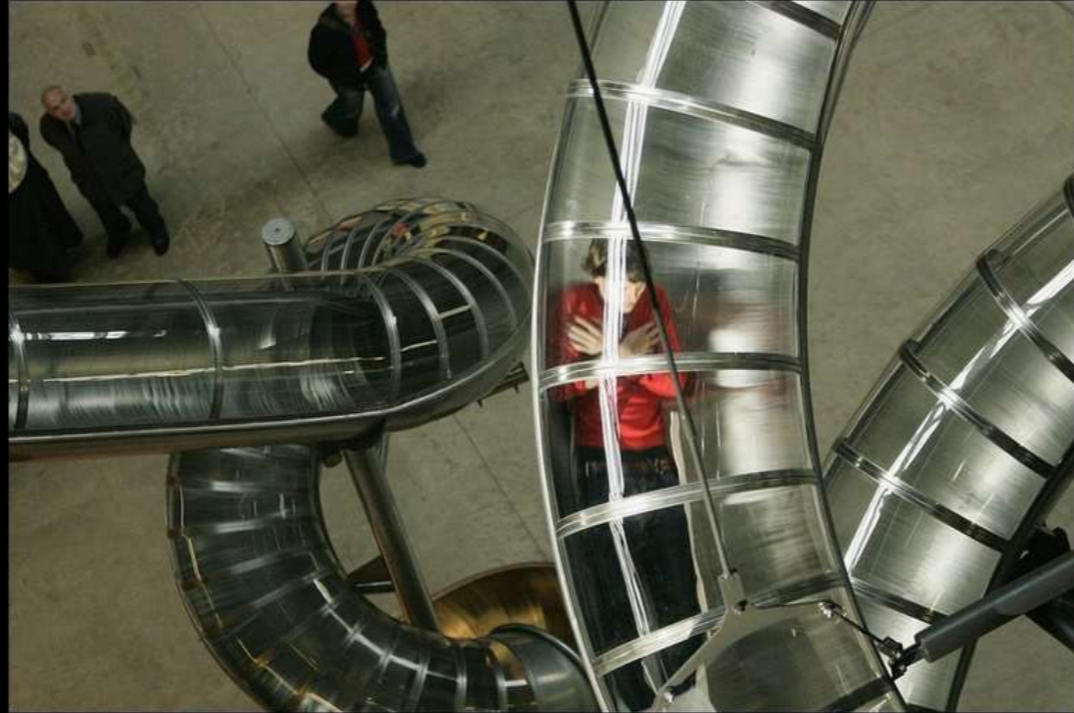
Test Site, 2006 Turbine Hall, Tate Modern, Carsten Höller Alternative transportation in tall spaces and feeling of freedom, lack of control and euphoria when sliding