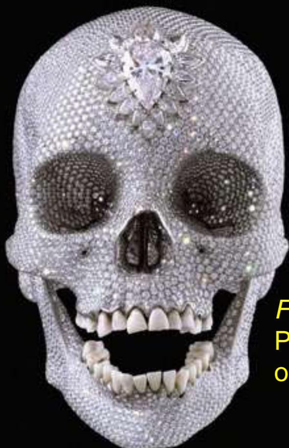
For the Love of God Platinum skull, 8601 diamonds, original teeth, 2007