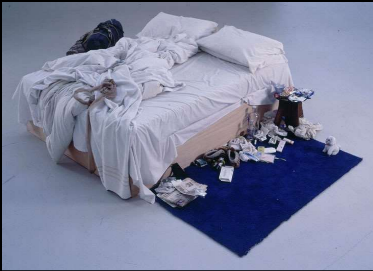
My Bed, Tracey Emin Nominated for the Turner Prize - 1999 Emin claims that the bed displayed was in the same state she left it after spending several days lying in it have suicidal thoughts