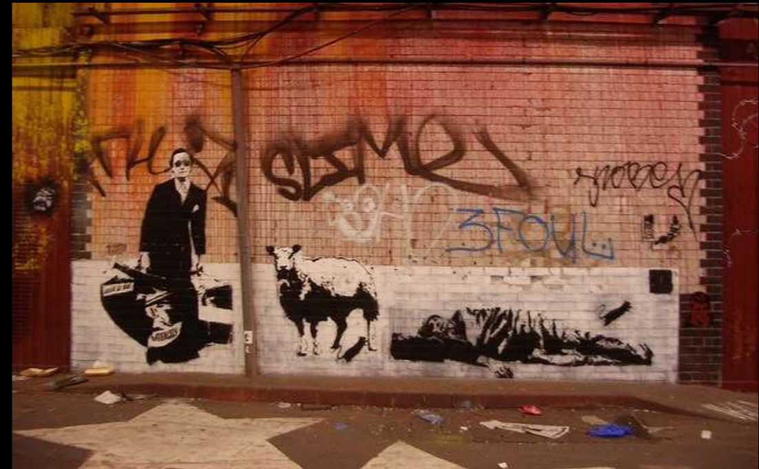
London, 2008, Blek le Rat

"the only free animal in the city" and one which "spreads the plague everywhere, just like street art" Blek le Rat