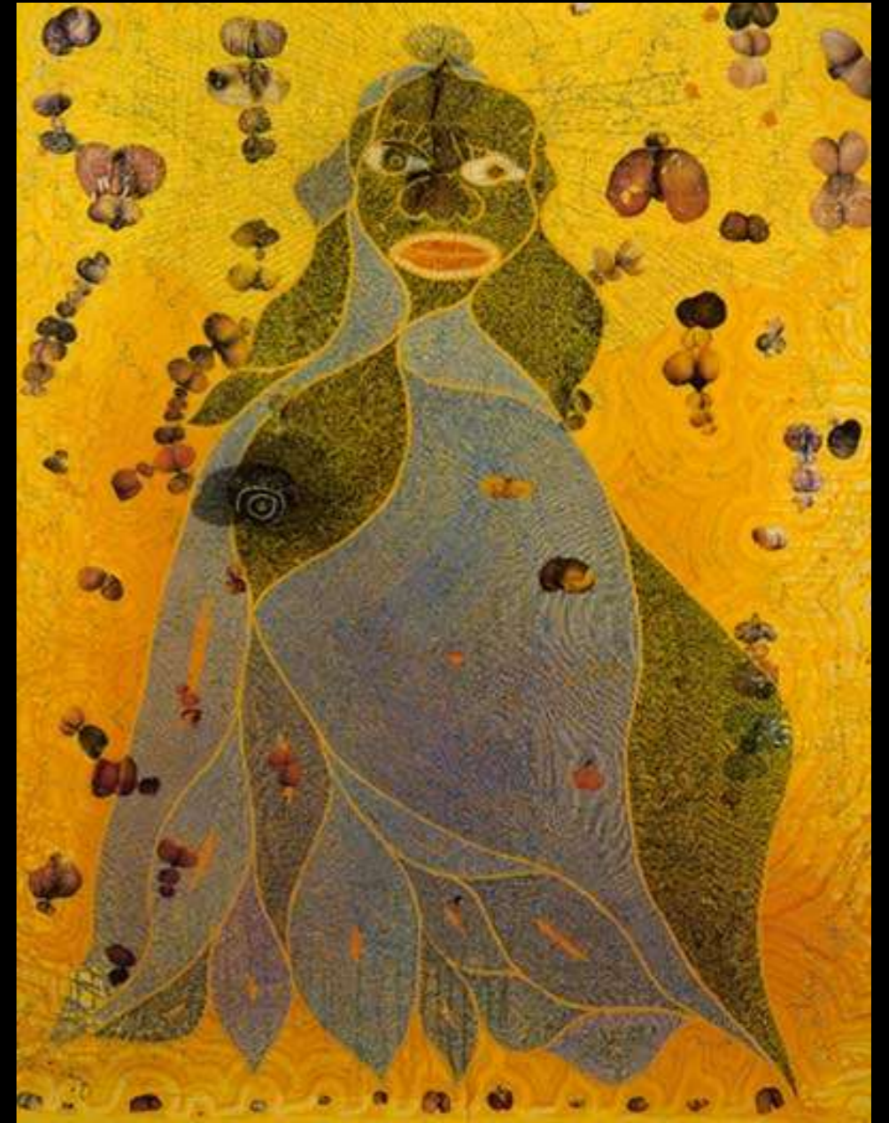
Holy Virgin Mary, Chris Ofili (with elephant dung)