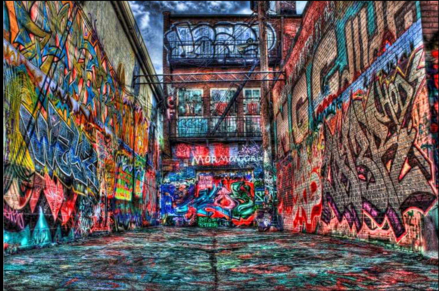
Hip Hop inspired Graffiti